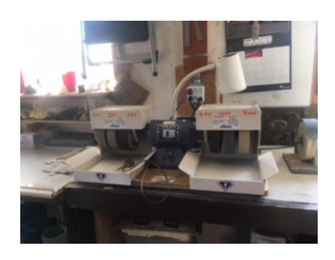
One of our 4 GENIES