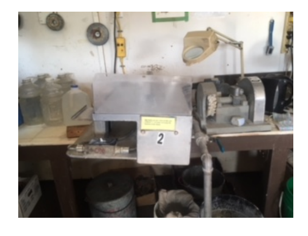
10" trim saw beside a buffing wheel