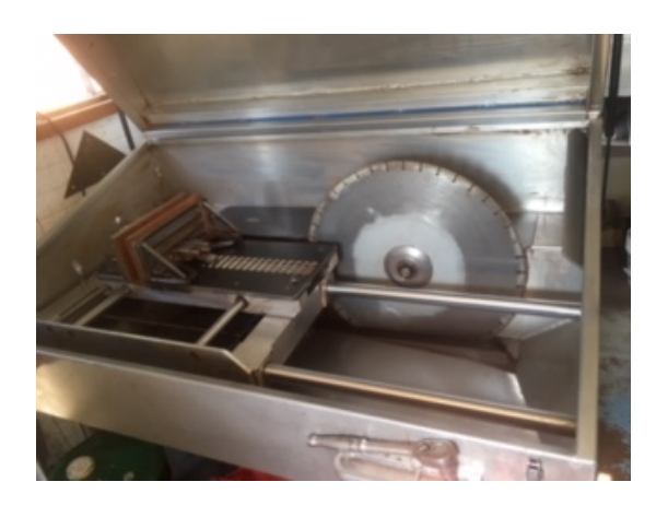
24" SLAB SAW