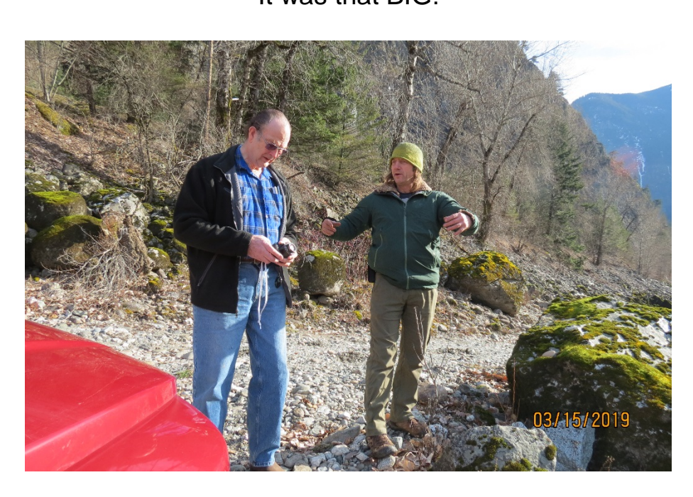
It was that BIG!

DVD about volcanoes and plate tectonics, specifically Mediterranean volcanoes and Mediterranean plate tectonics.