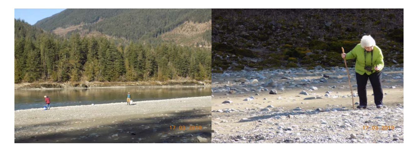
Bar on East side of river at the end of the wiggle jiggle road.