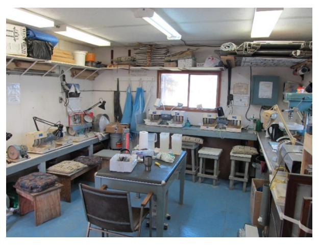
Quiet and clean, but not in use