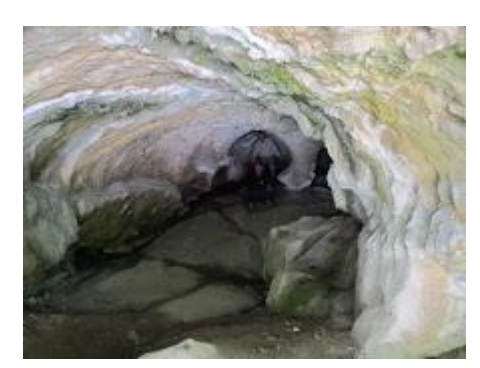
Rock formations created by flowing water through the limestone

Other finds in this area include some very colourful Gordonite that we stumbled upon while the construction of the Kokish Dam was underway.