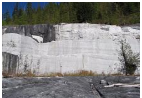
A view of some of the marble at Bonanza Lake

On Vancouver Island there are many locations where marble can be found but the seam around the Bonanza Lake is quite large and very interesting. There are signs of how the marble was 'mined' at the main site and I marvel at how such large pieces of rock would have been hauled out of the backcountry to transport to the mill site for working. Indeed, moving 25 tonne pieces of rock onto a flatbed would have been an engineering feat in itself.