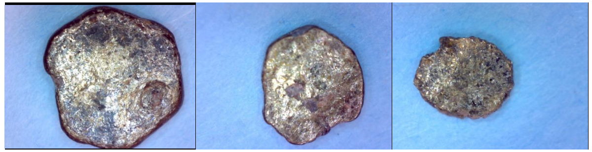
Three samples of the phlogopite crystals on Playas del Sol

It doesn't take much mica to make a beach sparkle, says the beach conservation website coastalcare.org. Thanks to a sheet-like atomic arrangement, specks of mica end up being lightweight and flat, meaning that they're easily washed away by waves. However, the shiny flat flakes act like millions of tiny mirrors thrown into the sand, and are so reflective in the sunlight that they are visible even when mica accounts for less than one percent of the sand grains on a beach, the site says.