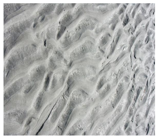
close up of the glittering mica

The research I did turned up a great deal of information about the mineral that I was oblivious to beforehand. It also reminded me of the 2 quotes cited in this edition one by JRR Tolkien and the other by the bard, Shakespeare as well as the lyric by Bruce Cockburn.