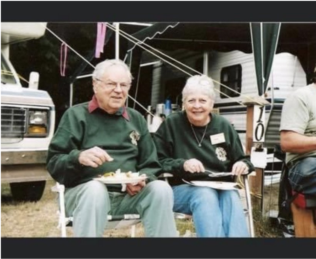
Port McNeill (Cluxewe campground), Gemboree 2006

course, you cannot go to those places and come home without going through Washington, Oregon, Idaho and California.