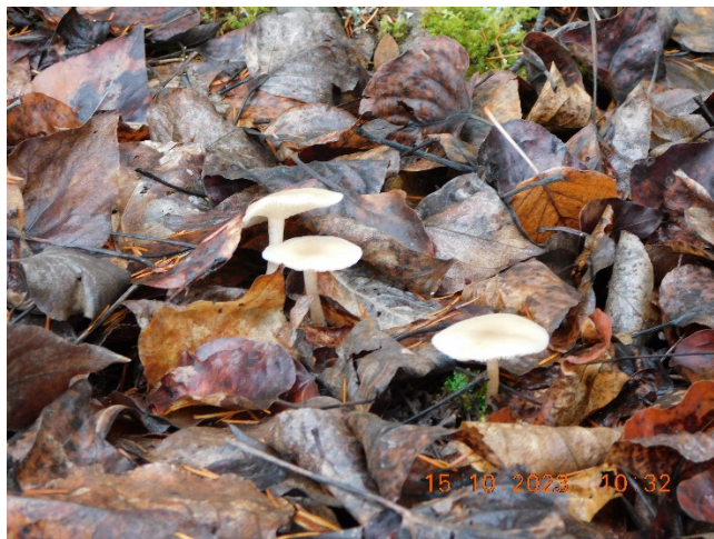
Not the paying ore of the mine