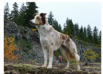
First sight of the mine