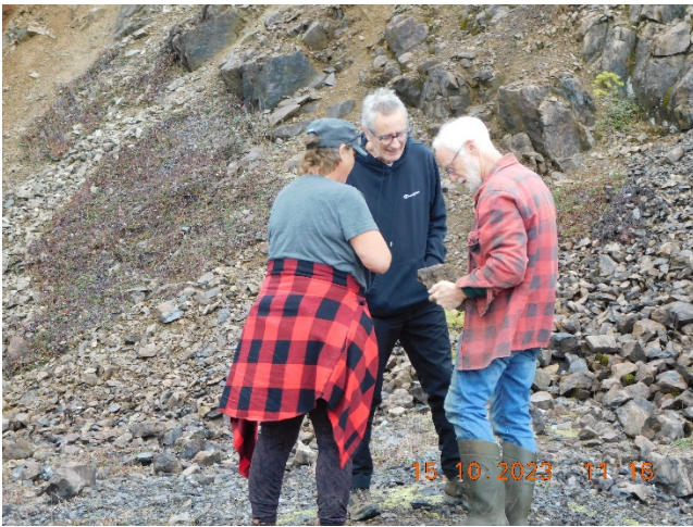
Consulting the expert