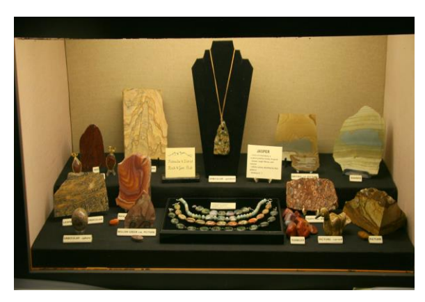
Courtenay's Club Display