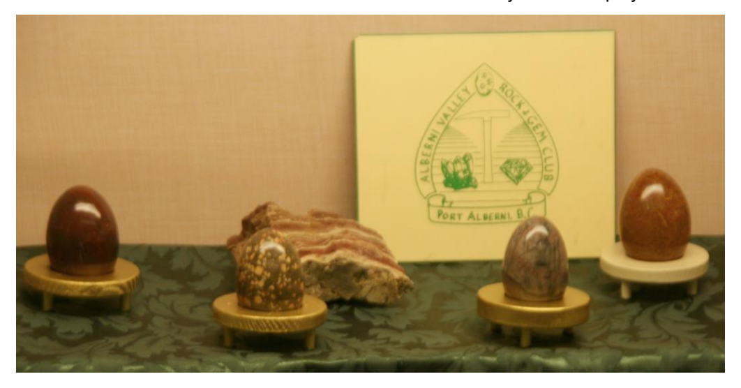
Port Alberni's Display