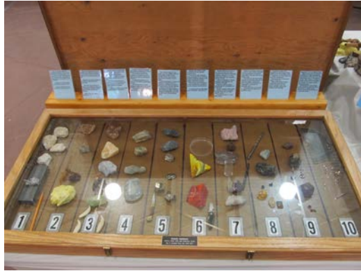
Charlie's hardness scale specimens