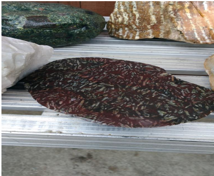
Interesting rice rock