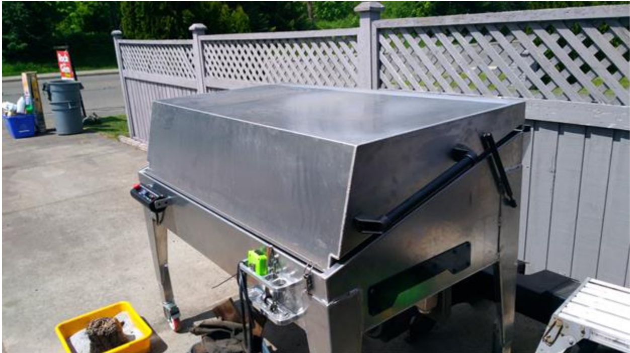
The York Machine 24" rock saw in its new home