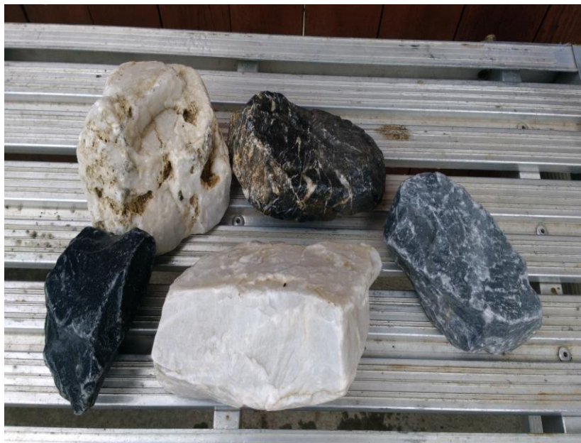
Some of the marble found in streams and at a loading site

This will be one of the featured collecting sites visited during the 2017 Gemboree. A word to those who like to head out on their own, this is in an active logging area with oversize trucks hauling logs. Please check in with the local company to give them a heads up and find out where the trucks are hauling from.