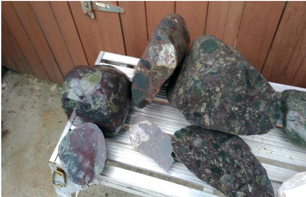
Cut conglomerates with greens, purple and pastel colours