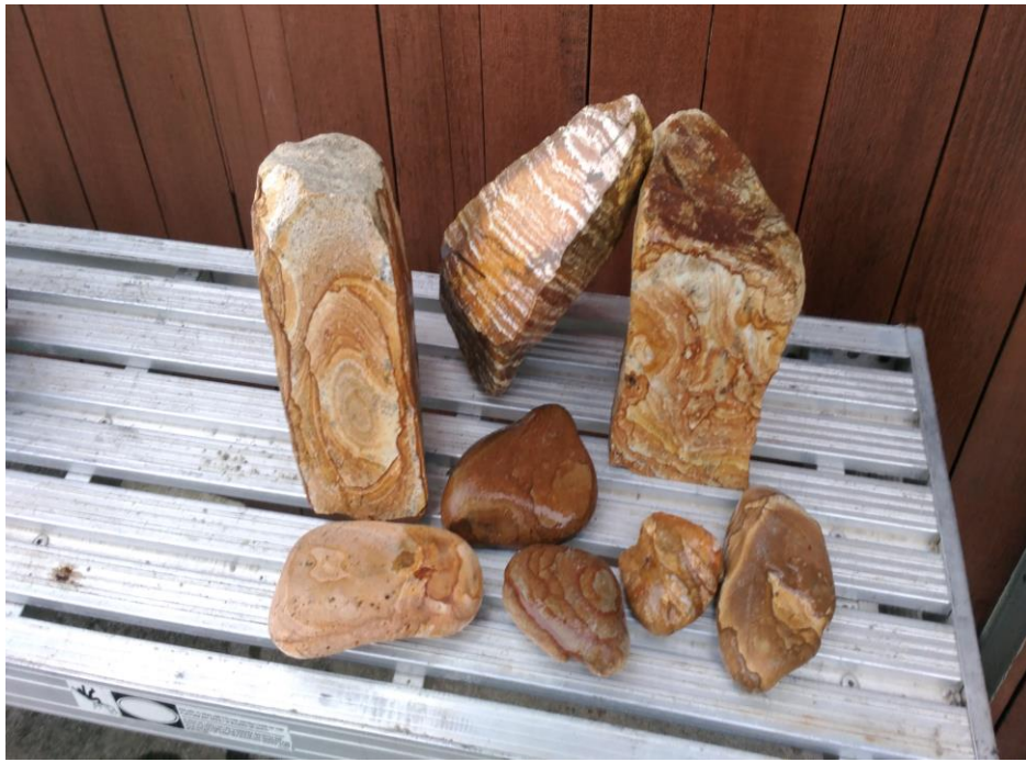
'Picture stone taken from several locations