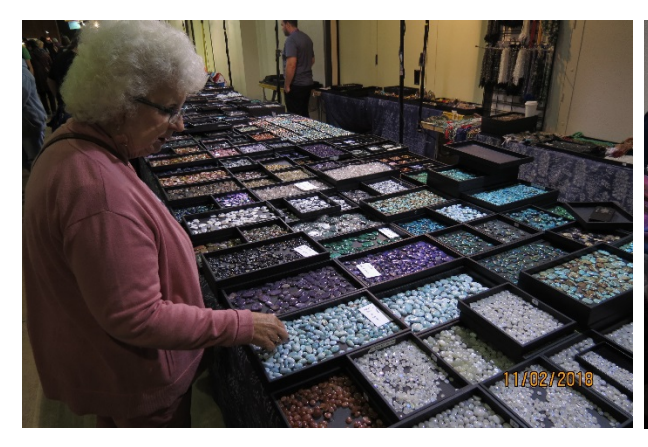
Lapi lazuli (did enquire and bought it)